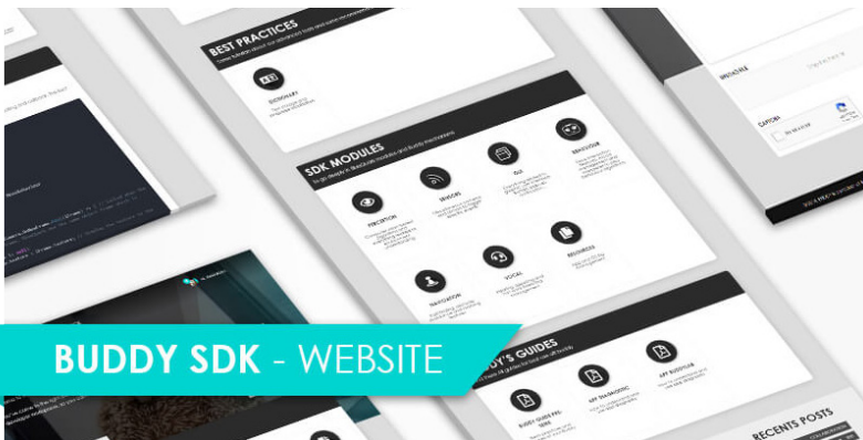
BUDDY SDK - WEBSITE